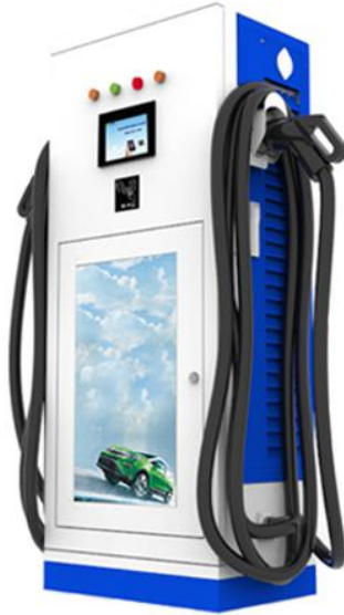
120KW Stand/Floor-type DC Charging Pile